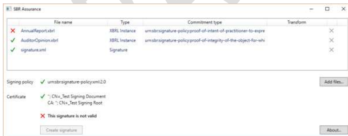
Figure 3: proof of concept desktop tool (OpenSBR Assurance) – verification of a signature

The integrity of a signed document set can be tested by opening the detached signature and original files in the tool; either by adding files one by one, or by adding a ZIP file containing all files.