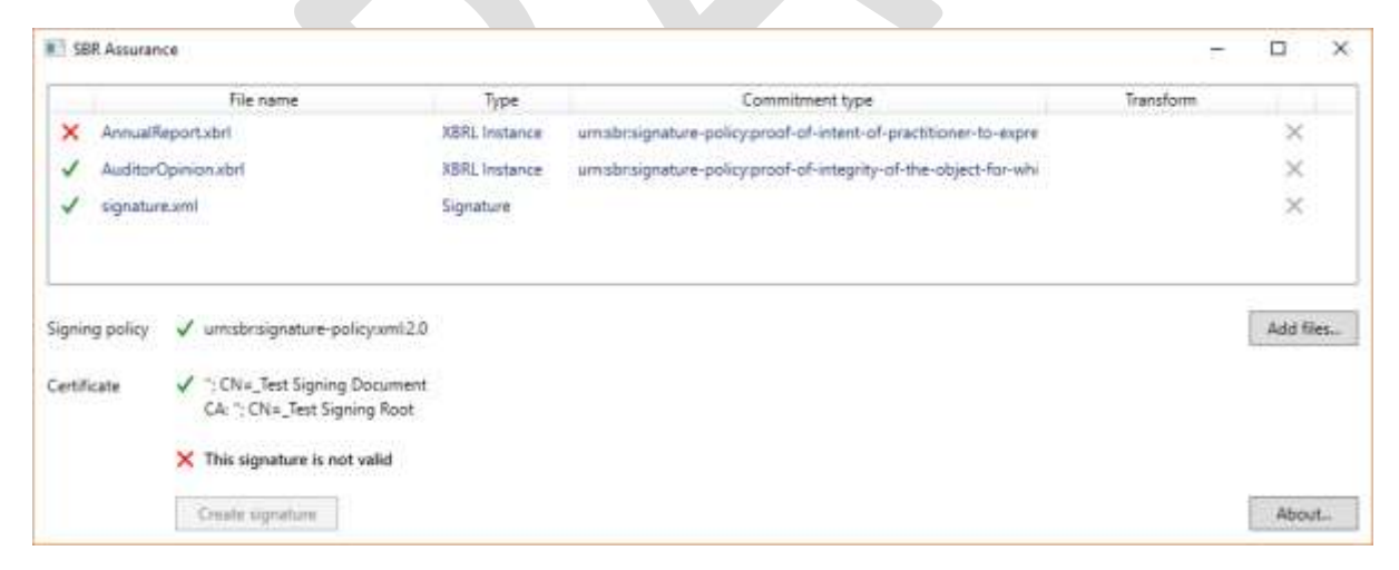
Figure 3: proof of concept desktop tool (OpenSBR Assurance) – verification of a signature

The integrity of a signed document set can be tested by opening the detached signature and original files in the tool; either by adding files one by one, or by adding a ZIP file containing all files.