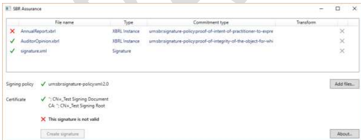
Figure 3: proof of concept desktop tool (OpenSBR Assurance) – verification of a signature

The integrity of a signed document set can be tested by opening the detached signature and original files in the tool; either by adding files one by one, or by adding a ZIP file containing all files.